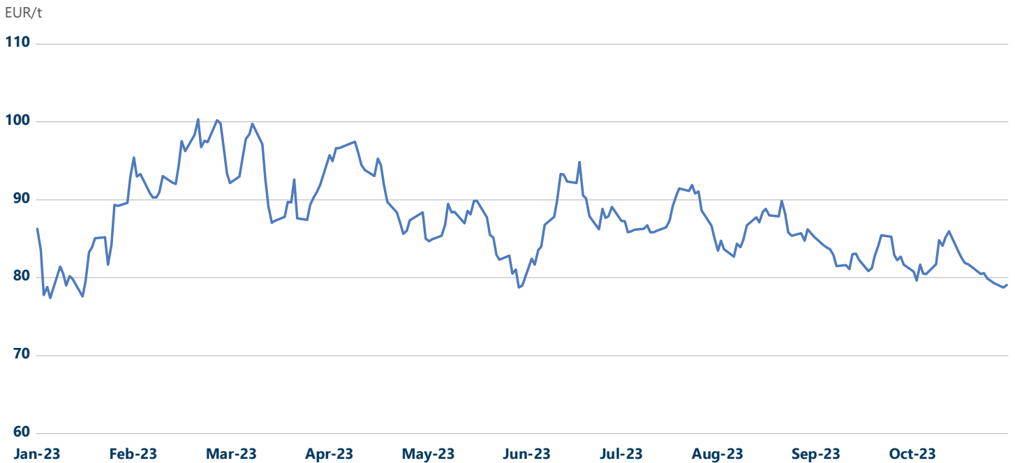
EU Allowances Price Trend in 2023

In October, the EU carbon price mirrored the trajectory of natural gas prices, initially surging before experiencing a decline. Based on EEX data, the EUA futures DEC23 contract climbed from 80.8 euros at the start of the month to its peak of 85.95 euros on October 13, before gradually dropping to 78.72 euros, marking the lowest point for the year by the month's end. During the first half of the month, several factors contributed to an upswing in expectations for increased natural gas demand, including the escalation of the Israel-Palestine conflict, damage to the Finnish natural gas pipeline, and a notable drop in expected temperatures across much of Europe. These dynamics propelled a rapid upturn in carbon prices.