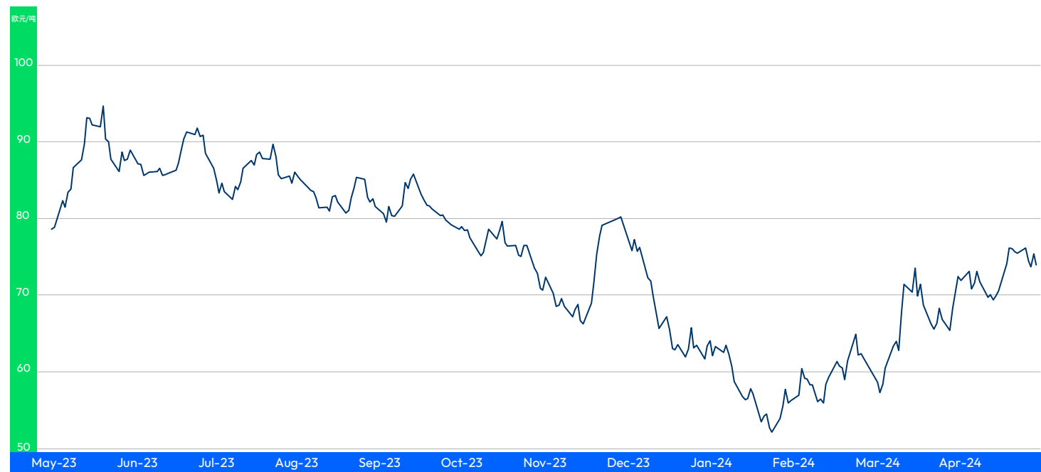
EU Allowances Price Trend

In May 2024, EUA futures prices maintained an upward trend, recording a daily average settlement of €73.1 per ton, up 10.64% from €66.07 per ton in April.